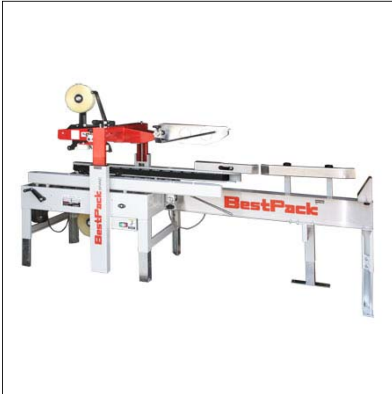
MSDBF22 Manual Side Drive