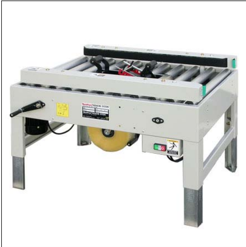
MSD22 Manual Side Drive