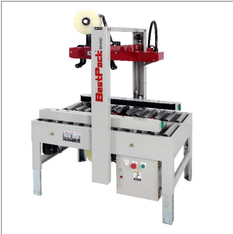
RS22 Random Side Drive