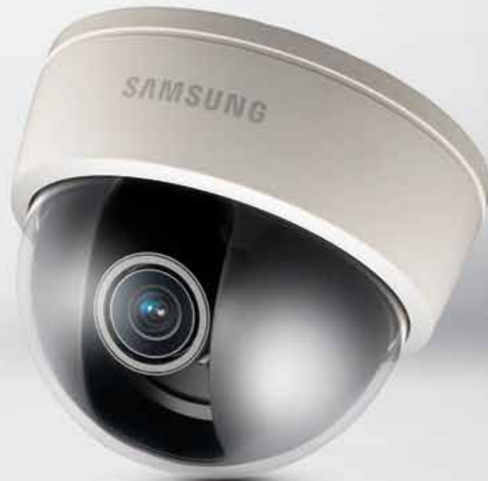
VGA Network Varifocal Dome Camera