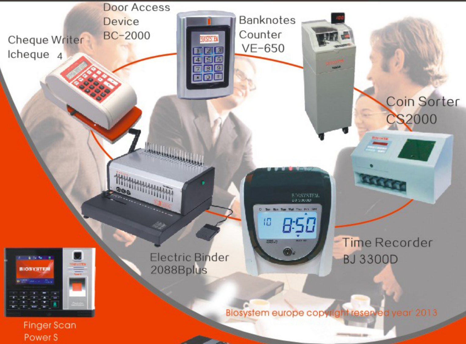
Cheque Writer lcheque 4