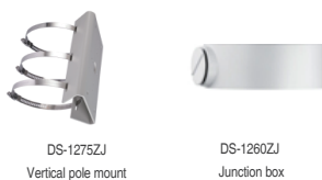
DS-1275ZJ Vertical pole mount