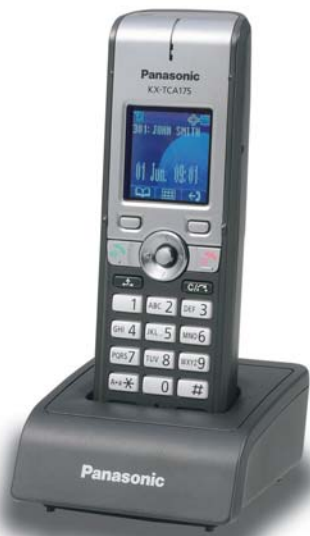
KX-TCA175 Standard Model