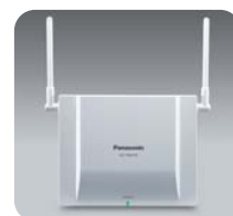
KX-TDA0158 8ch Cell Station