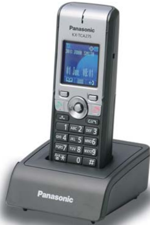
KX-TCA275 Compact Business Model