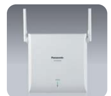
KX-NCP0158 8ch IP Cell Station