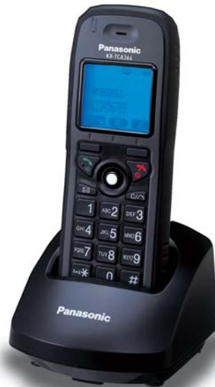
KX-TCA364 Tough Type Model