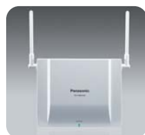
KX-TDA0156 4ch Cell Station