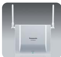
KX-TDA0155 2ch Cell Station