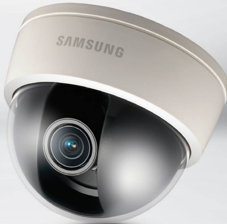
1.3 Megapixel HD Network Dome Camera