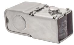
MMG – Special DC

Requires ASC2 female connector (PCN 059261).