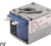
AMS - Open Frame