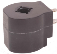
ASC2 – DIN

Requires ASC2 female connector (PCN 059261).