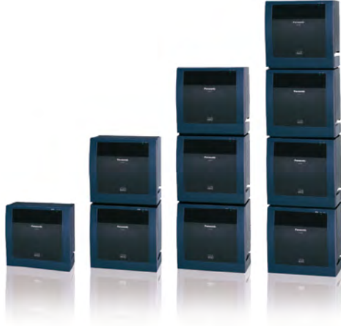
LINE-UP : KX-TDE600 AND THE OPTIONAL EXPANSION SHELF KX-TDE620 (MAX3)