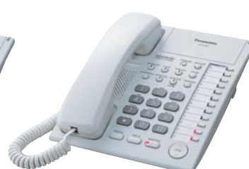
■ KX-T7750 Monitor Unit