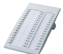
■ KX-T7740 DSS Console