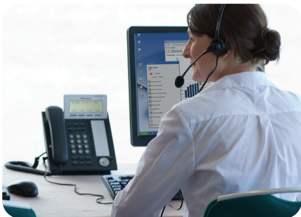
CA - PROVIDING UNIFIED COMMUNICATIONS