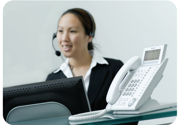
RECEPTIONIST USING COMMUNICATION ASSISTANT

Operator Console also supports the following additional options: