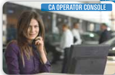
CA OPERATOR CONSOLE