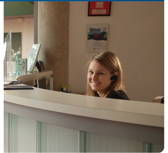
COMMUNICATION ASSISTANT BROCHURE