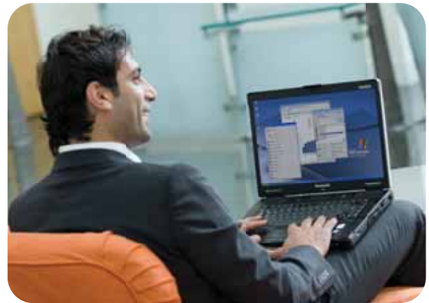
A TEAM MANAGER USING CA SUPERVISOR

Communication Assistant Supervisor application is an indispensable productivity tool for team managers and supervisors. The software allows team leaders an easy way to keep an eye on all their team members' telephony communication activities. Group leaders can easily monitor team member's phone status, call details, presence and availability - perfect for managing an informal call centre or a small team receiving customer calls. In addition to the features supported by CA Pro, the following key features are additionally supported: