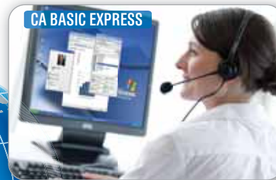
CA BASIC EXPRESS