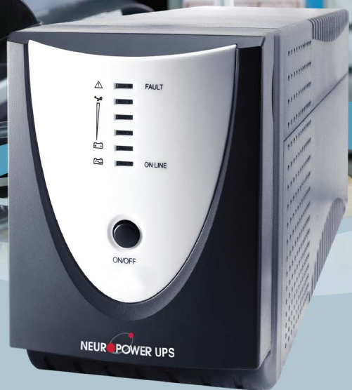
(BP1K0E - BP2K2E)