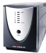
BP1K0E - BP2K2E (Front Panel)