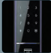
Keypad will display all numbers