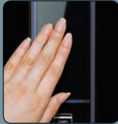
touch the Wake-up button

When the Wake-up button is pressed, Two(2) random numbers will be displayed on the keypad. The random numbers must be pressed prior to entering a user access code.