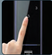
Press the displayed numbers in any order