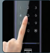
Enter your user access code