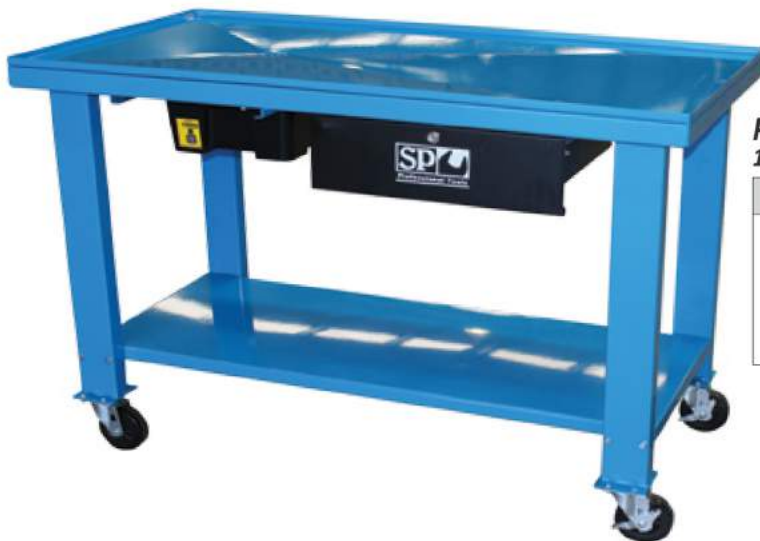
PROFESSIONAL ENGINE TEAR DOWN BENCH 1200W x 645D x 872H (mm)