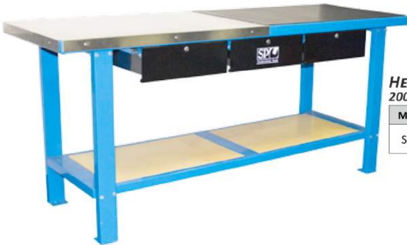
HEAVY DUTY WORKSHOP BENCH 2000W x 645D x 872H (mm)