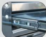
Smooth roller bearing sliders