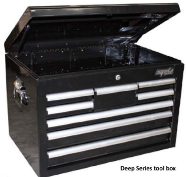
Deep Series tool box