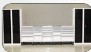
Joins together to storage on next page

*Tools & accessories not included. Images for illustration purposes only