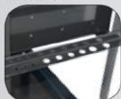
Screwdriver slots on both sides of trolley