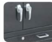
Lockable Drawer and Tool Drawer