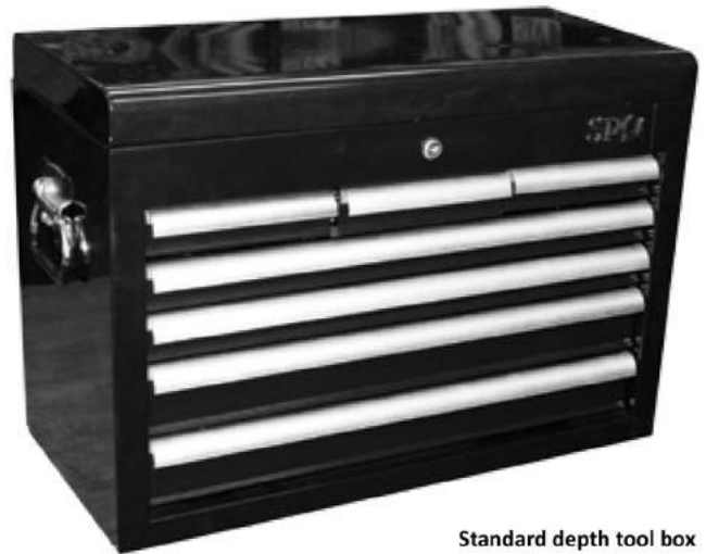
Standard depth tool box