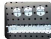
Adjustable Heavy Duty Tool Hooks