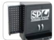
Dual Internal Sliding Tool Boards