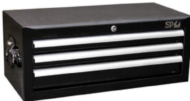
CUSTOM SERIES INTERMEDIATE TOOL BOX 3 DRAWER 670W X 316D X 265H