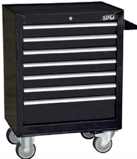
CUSTOM SERIES ROLLER CABINET 7 DRAWER 680W X 460D X 940H