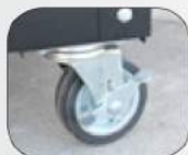
Lockable swivel castors