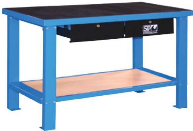
HEAVY DUTY WORKSHOP BENCH 1250W x 645D x 872H (mm)