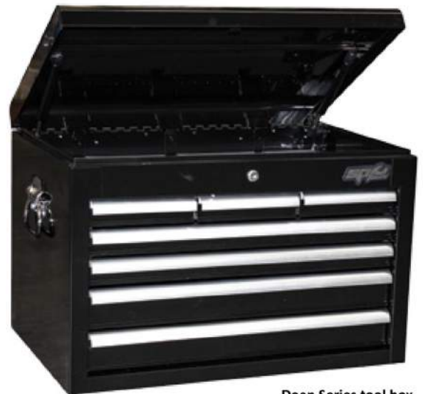
Deep Series tool box