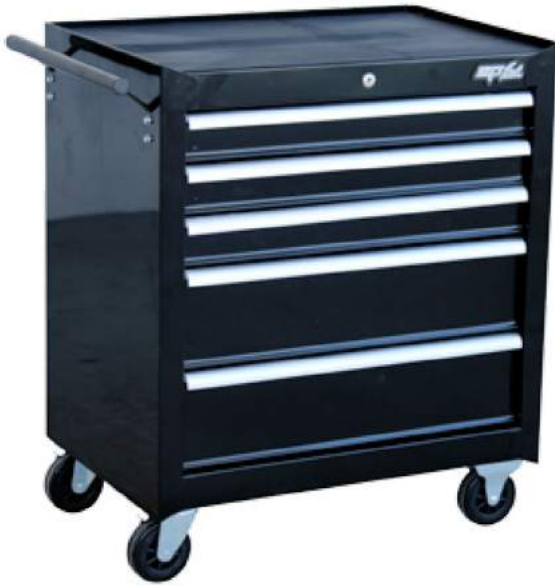
CUSTOM SERIES ROLLER CABINET 5 DRAWER 680W X 460D X 812H