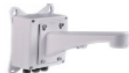
Wall Mount (with Termination Box)