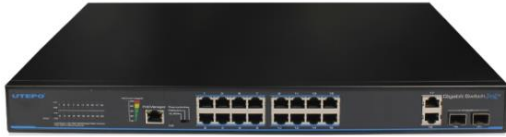
(SFP Fiber Optic Module Not Included)