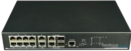
(SFP Fiber Optic Module Not Included)