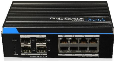
(SFP Fiber Optic Module Not Included)