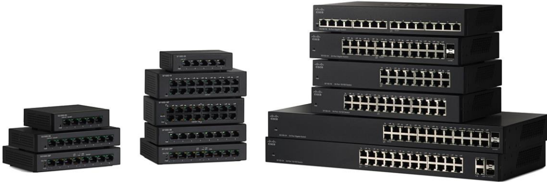
Figure 1. Cisco 110 Series Unmanaged Switches