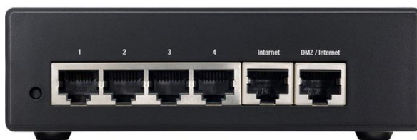
Figure 2. Back Panel of the Cisco RV042

Figure 2 shows the back panel of the Cisco RV042. Figure 3 shows a typical configuration.