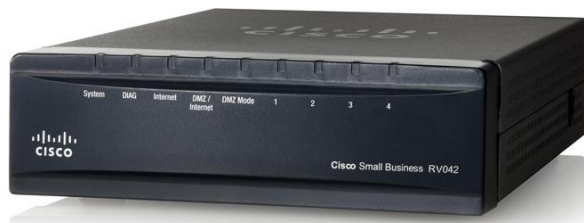
Figure 1. Cisco RV042 Dual WAN VPN Router

To further safeguard your network and data, the Cisco RV042 includes business-class security features and optional cloud-based web filtering. Configuration is a snap, using an intuitive, browser-based device manager and setup wizards.