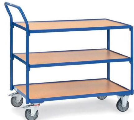
2750 | 2752