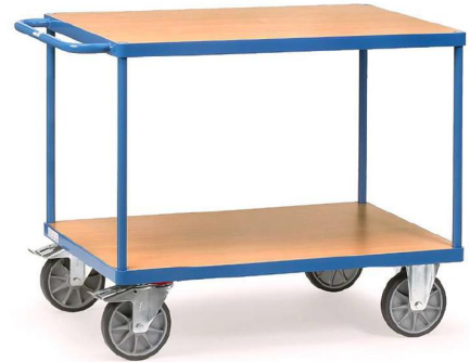
2400 | 2401 | 2402 | 2403