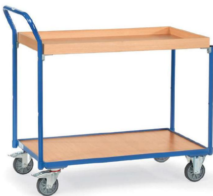
3740 | 3742