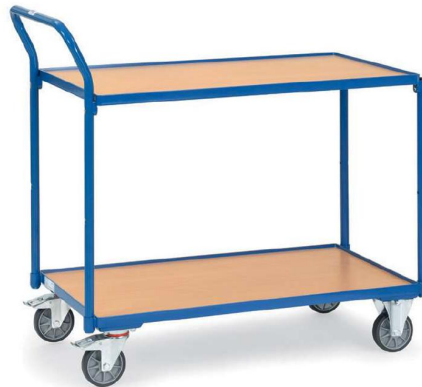
2740 | 2742