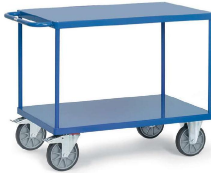
2400B | 2401B | 2402B | 2403B