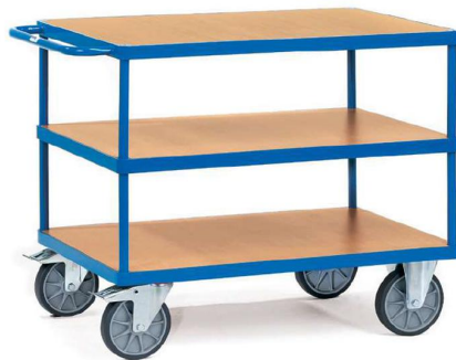
2420 | 2421 | 2422 | 2423