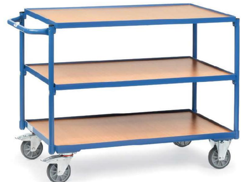
2950 | 2952