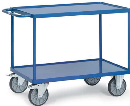
2400W | 2401W | 2402W | 2403W