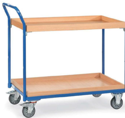
3760 | 3762