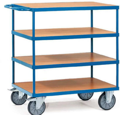
2442 | 2443