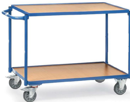
2940 | 2942

2740 | 2750 | 2742 | 2752 Constructed as above, but with a high push bar.