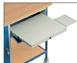
Detailed view keyboard drawer for rolling table 5866.