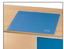
Blotting pad For the table board, blue, size 485 x 485 mm.