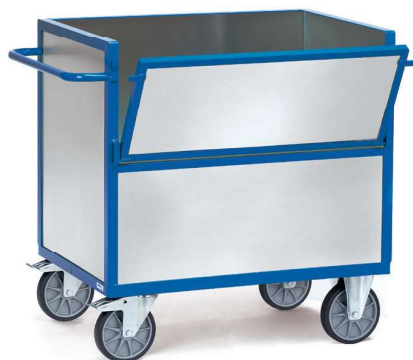
2822 | 2823