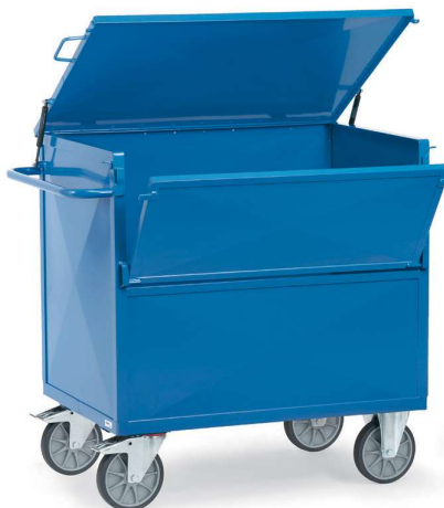
2862 | 2863