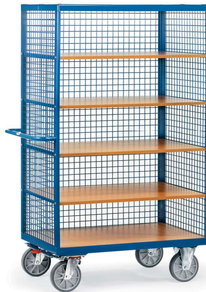
3392 | 3393