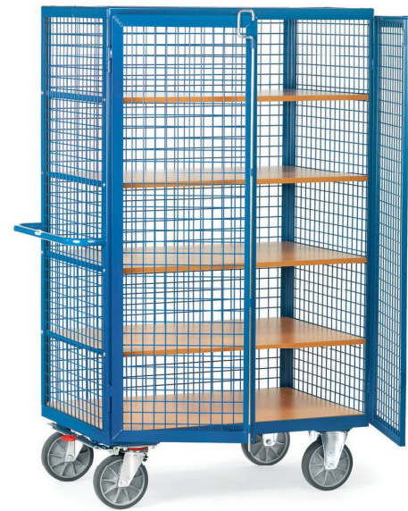
4392 | 4393 Padlock lockable rod system