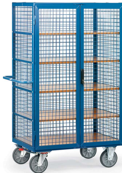
5392 | 5393 Vertical locking rod