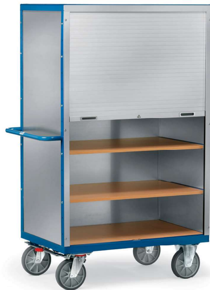
5692 | 5693