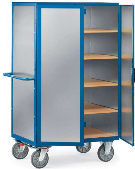
5592 | 5593 Aluminium sheet