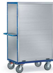
5692 | 5693 Closed