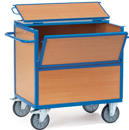
2852 | 2853