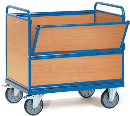
2872 | 2873