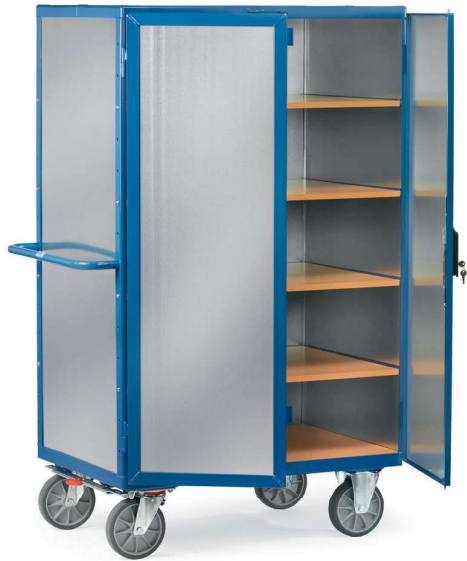
5492 | 5493 Galvanized steel sheet