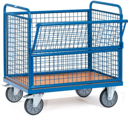
2772 | 2773

as 2762 | 2763, but sides and cover made of derived timber material boards, surface beech grain.