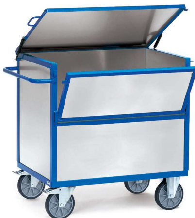
2832 | 2833