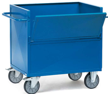
2842 | 2843