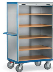
5692 | 5693 Open