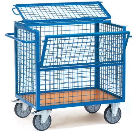
2762 | 2763