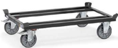
23799 | 23800 | 23801 | 23802