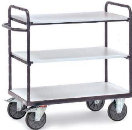
9100 | 9101