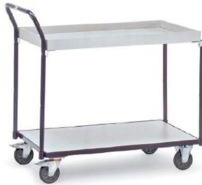
1860 | 1861