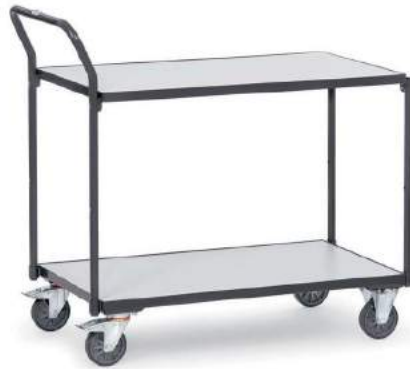
1840 | 1841