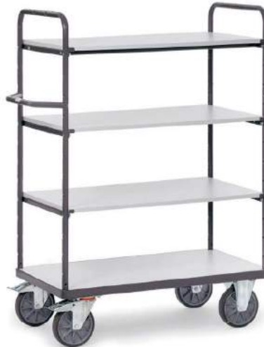
9200 | 9201