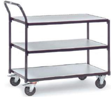
1850 | 1851