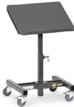
1891 | 1892