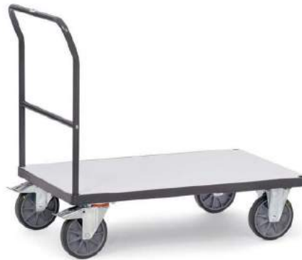
9500 | 9501 | 9502 | 9503