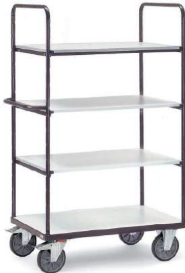
9301 | 9302 | 9303