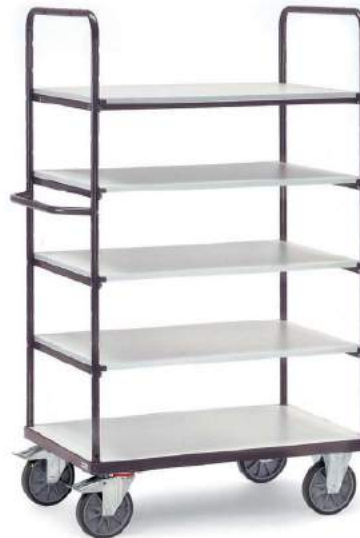
9341 | 9342 | 9343