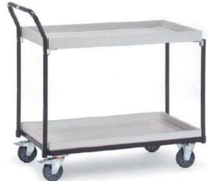
1870 | 1871