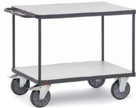
9400 | 9401 | 9402 | 9403