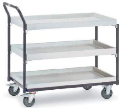
1880 | 1881