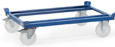
22879 | 22880 | 22881 | 22882