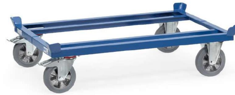
22809 | 22810 | 22811 | 22812