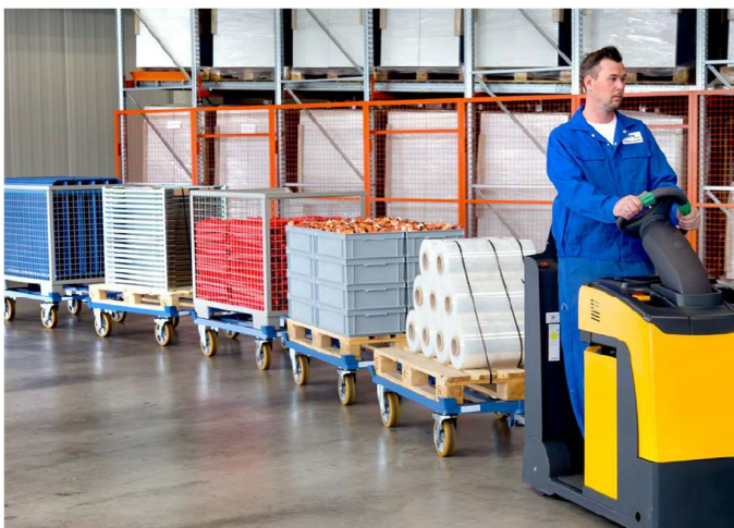
Secure and directionally stable operation