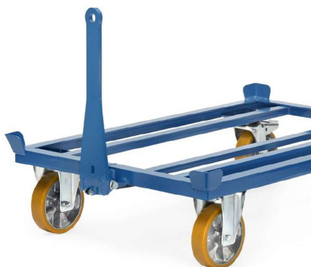
Detail shaft and tow hitch