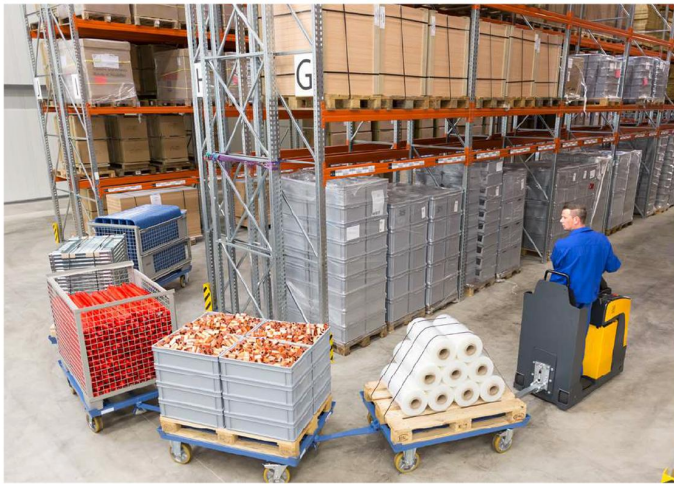
Easy to manoeuvre