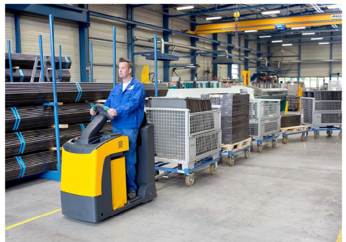
Numerous application options