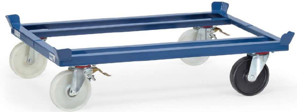
23891 | 23892