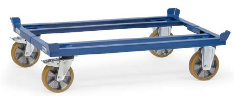
22699 | 22700 | 22701 | 22702

* All special versions on page 98/99 (stacking frames, tubular sliding bar, handle, self-locking push handle and coupling) are not suitable.