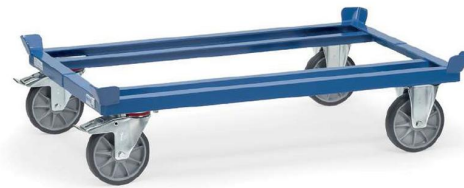
22799 | 22800 | 22801 | 22802