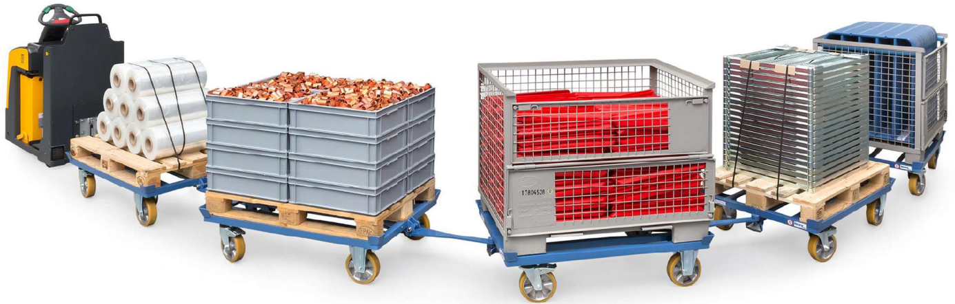
Tugger train with electric tractor and 5 pallet carriages