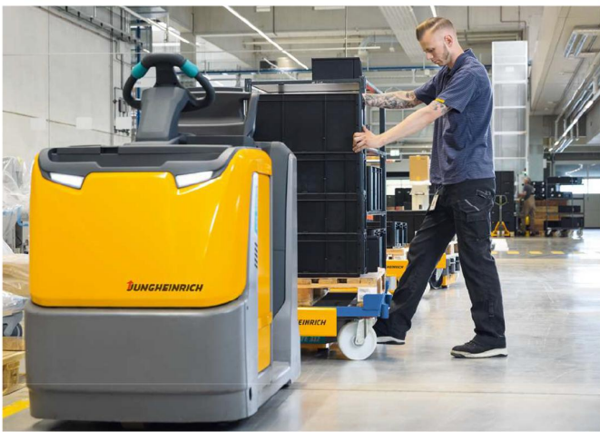
Application in practise