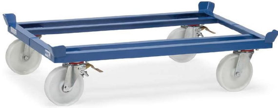
23881 | 23882