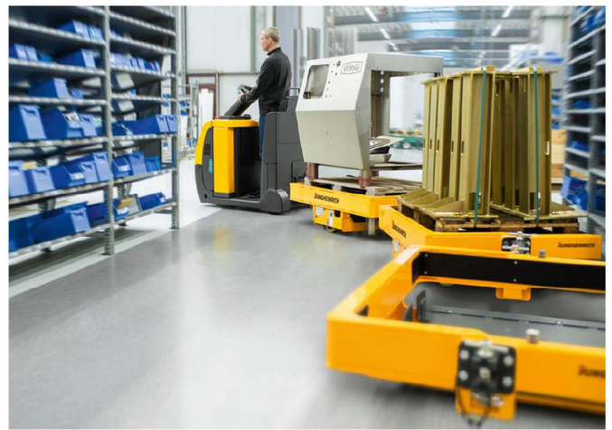
Application in practise