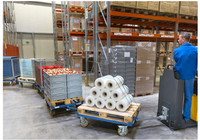
Very high directional stability