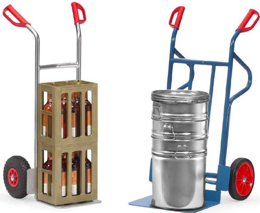
A1125L | B1216V

The right truck for each purpose • With solid rubber or pneumatic tyres • With small or big front shovel • Positioned upright or angular • Tubular steel truck neatly welded, steel sheet front shovel mountable, therefore exchangeable • Powder coated blue RAL 5007 • Aluminum trucks neatly welded and „natural“ • Aluminum sheet shovel mountable, therefore exchangeable • Wheels with plastic rim, hubs with roller bearings • Curved top bar and transversal struts. For safe transport of circular items such as rolls, cans, buckets etc.