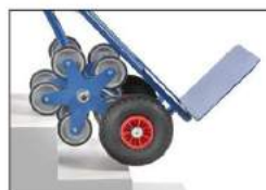
Five-arm wheel spider TK1327 | TK1328