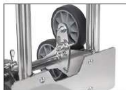
Wheel spider lock 1770 Add-on kit for stairway trucks AK1325 and AK1326. For easy moving on 2 wheels on flat surface. Easy self assembly.