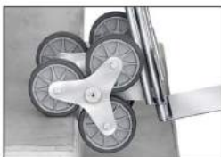
Three-arm wheel spider AK1325 | AK1326