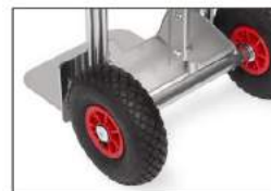
Wheel-fixing screwed wheel fixing, easy wheel change.