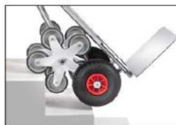
Five-arm wheel spider AK1327 | AK1328