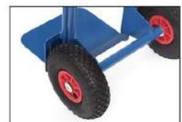
Wheel-fixing screwed wheel fixing, easy whell change.