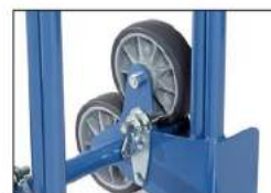
Wheel spider lock 1770 Add-on kit for stairway trucks TK1325 and TK1326. For easy moving on 2 wheels on flat surface. Easy self assembly.