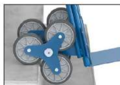
Three-arm wheel spider TK1325 | TK1326