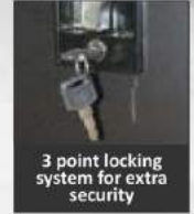
3 point locking system for extra security