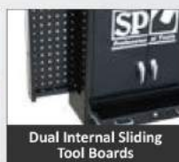
Dual Internal Sliding Tool Boards

UTILISES UNUSED WALL SPACE TO FREE UP FLOOR OR BENCH SPACE