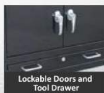
Lockable Doors and Tool Drawer