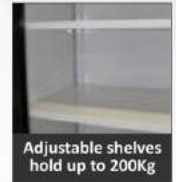
Adjustable shelves hold up to 200Kg