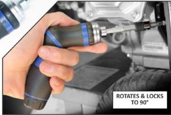
ROTATES & LOCKS TO 90°