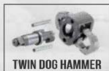
TWIN DOG HAMMER