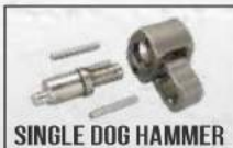
SINGLE DOG HAMMER