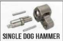
SINGLE DOG HAMMER