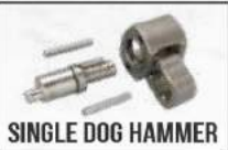
SINGLE DOG HAMMER