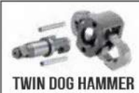
TWIN DOG HAMMER