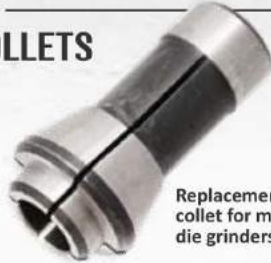
Replacement collet for most die grinders