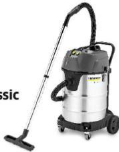
NT 70/2 Me Classic