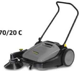
KM 70/20 C