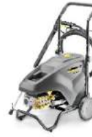
HD 9/20-4 Classic