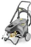
HD 6/15-4 Classic