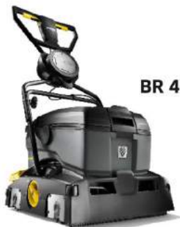
BR 40/10 C Adv