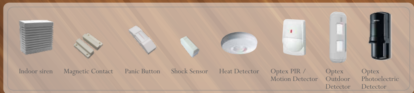
Indoor siren Magnetic Contact Panic Button Shock Sensor Heat Detector Optex PIR / Motion Detector Optex Outdoor Detector Optex Photoelectric Detector