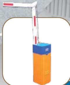
Folding arm 90°