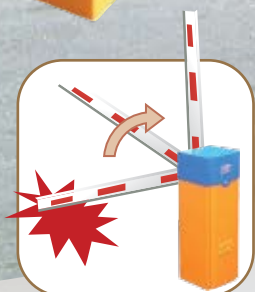
Auto reserve arm