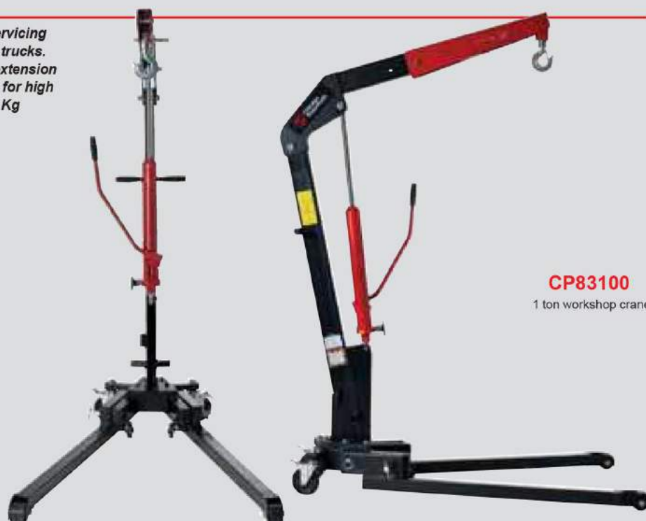
CP83100 1 ton workshop crane

The CP workshop crane is ideal for servicing passenger vehicles, SUV and pick-up trucks. It's equipped with a hoist arm with 3 extension positions and pin locking mechanism for high access up to 53.1 in / 1350 mm @ 500 Kg