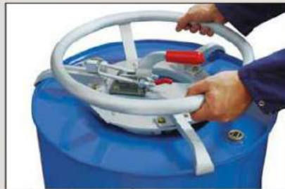
Drum cart for corrugated steel drums