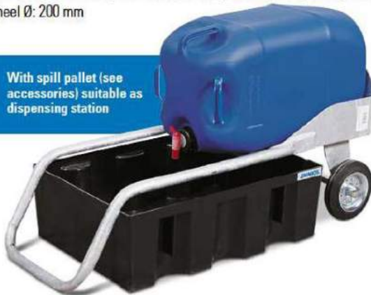
Sump pallet PolySafe Euro type W2-60 for putting containers directly into, Order no. 129-038-J9, £ 132.00

i With spill pallet (see accessories) suitable as dispensing station