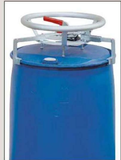
Drum dolly for plastic l-ring drums