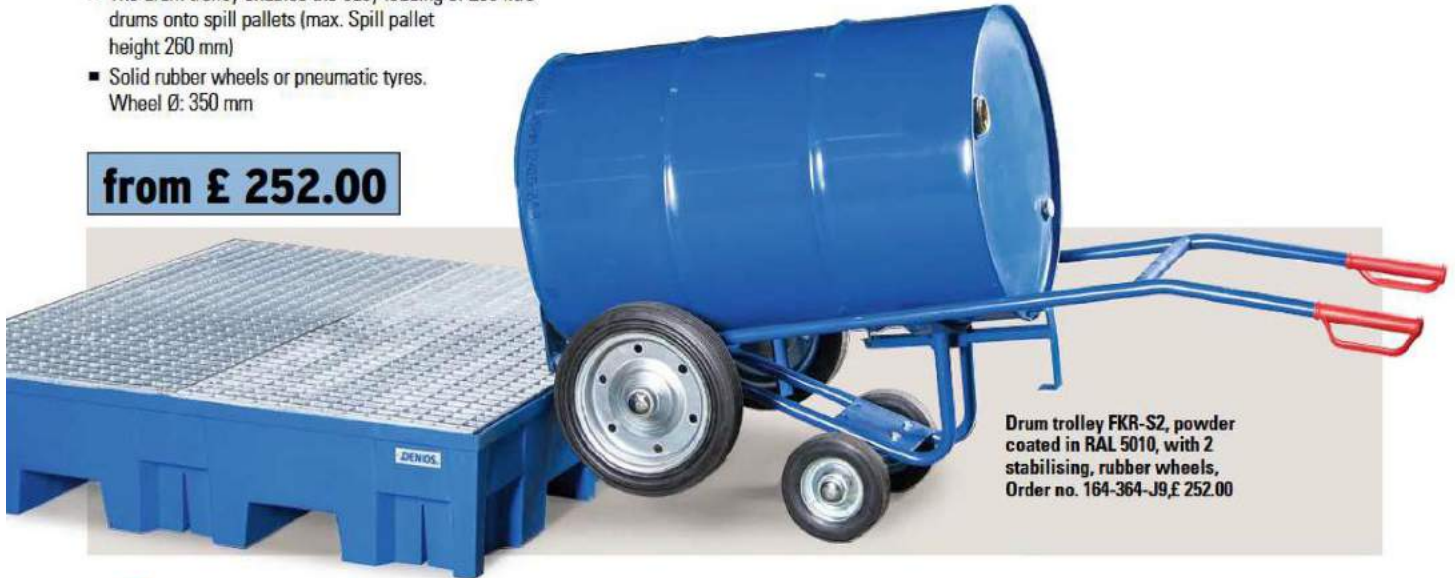
Drum trolley FKR-S2, powder coated in RAL 5010, with 2 stabilising, rubber wheels, Order no. 164-364-J9, £ 252.00