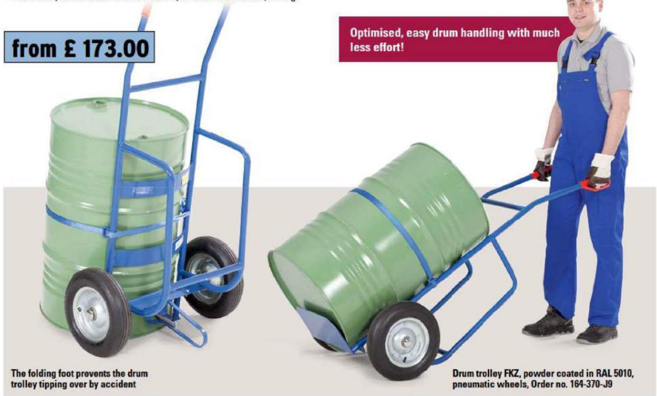
The folding foot prevents the drum trolley tipping over by accident

Optimised, easy drum handling with much less effort!