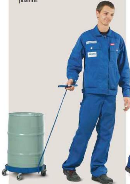
Steel drum dolly DT 1 / 60 for 60 litre drums, incl Drawbar