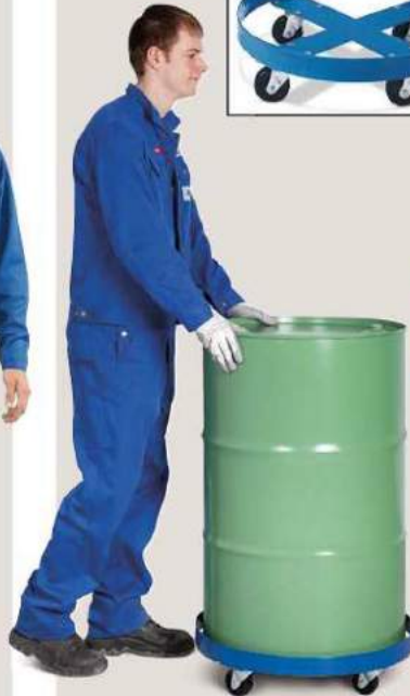
Drum dolly DT 1 / 200, in steel for 205/220 litre drums