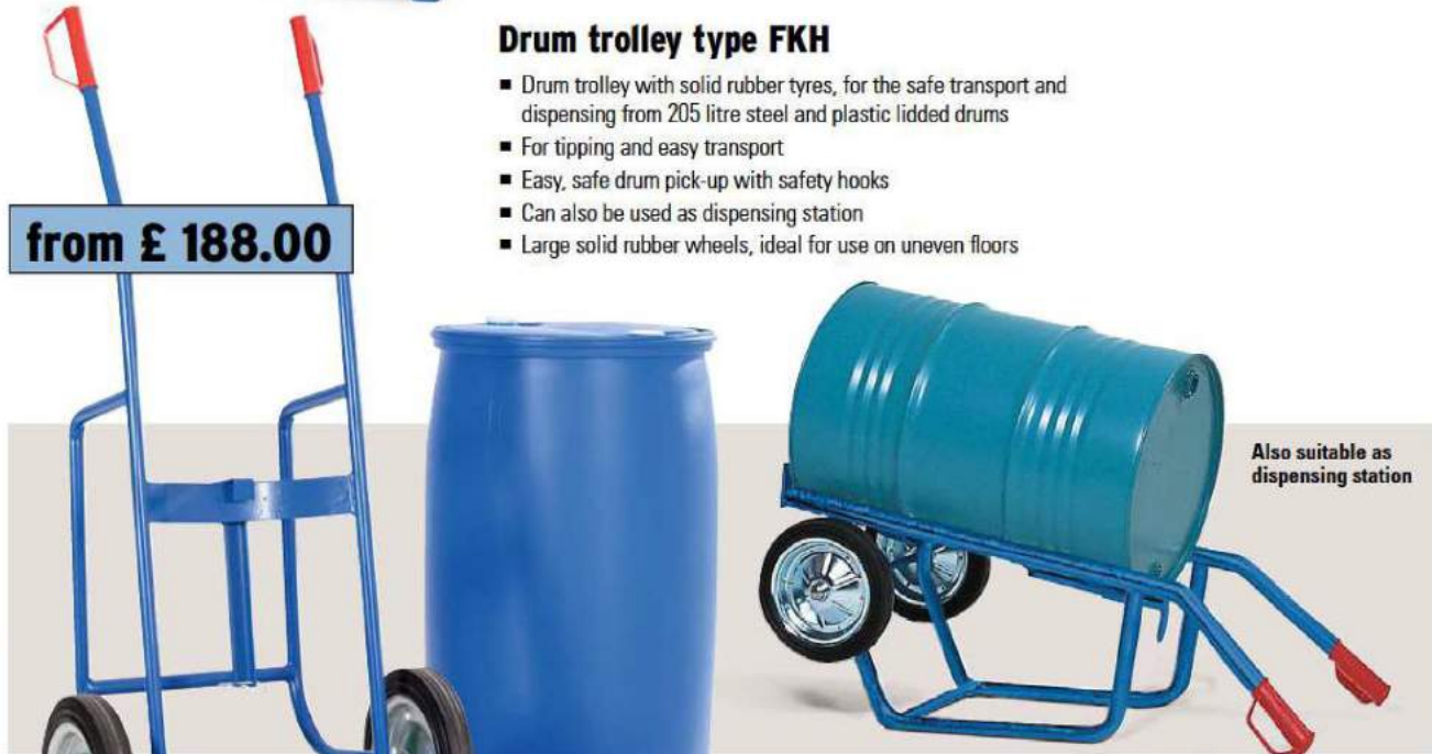
Also suitable as dispensing station