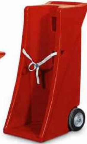
Gas cylinder trolley model GFW-1 in polyethylene, for 1 cylinder (max. Ø 320 mm)