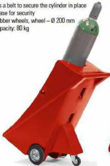
Gas cylinder trolley model GFW-1-S in polyethylene with support wheel, for 1 cylinder (max. Ø 320 mm), Order no. 156-435-J9, £ 223.00