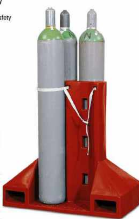
Gas cylinder pallet model GFP-4 in polyethylene, for 4 cylinders (max. Ø 230 mm), Order no. 155-648-J9, £ 279.00