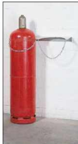
Wall bracket model WH 320-S, for up to 2 gas cylinders with max. Ø 320 mm