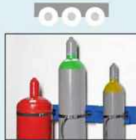
Kit for 3 gas cylinders