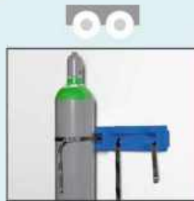
Kit for 2 gas cylinders