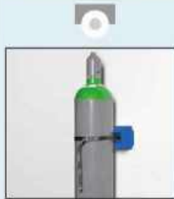
For 1 gas cylinder