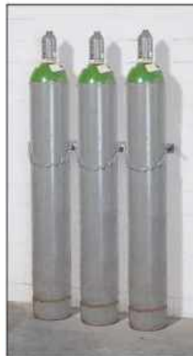
Wall bracket model WH 230-S, for up to 3 gas cylinders with max. Ø 230 mm