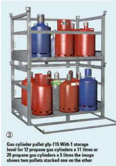
③ Gas cylinder pallet gfp-115 With 1 storage level for 12 propane gas cylinders x 11 litres or 20 propane gas cylinders x 5 litres the image shows two pallets stacked one on the other