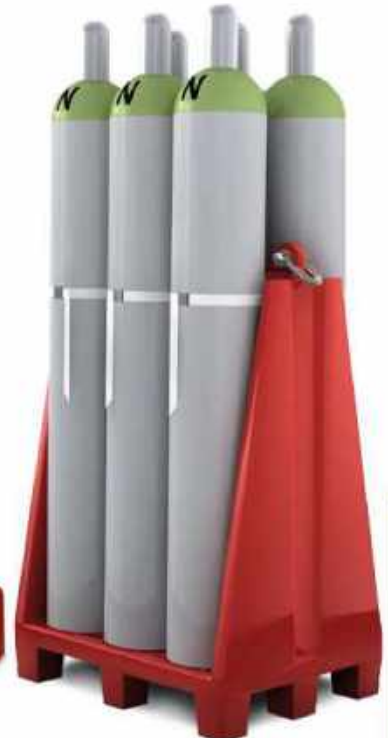
Gas cylinder pallet model GFP-6 in polyethylene, for 6 cylinders (max. Ø 230 mm), Order no. 187-304-J9, £ 357.00

Expert Hotline and Order line: 01952 700 572