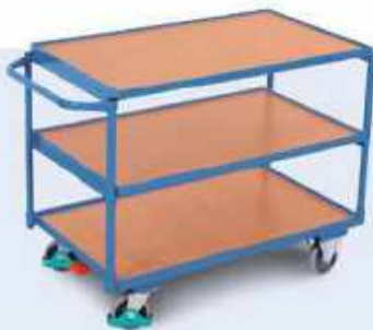
The straight handle makes transport easy, even for bulky loads