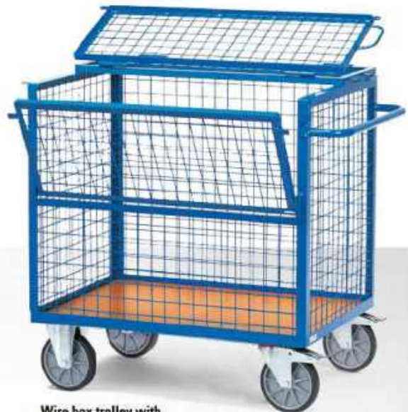
Wire box trolley with front flap and lid