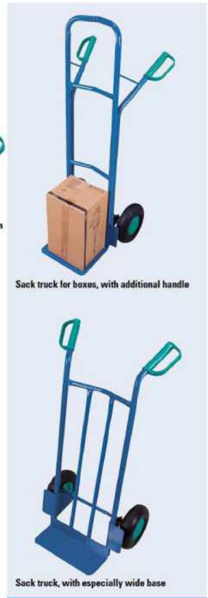
Sack truck for boxes, with additional handle