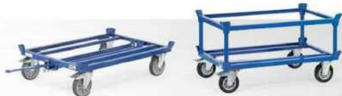
Chassis, loading height 270 mm and TPE tyres (towing handle - see accessories)