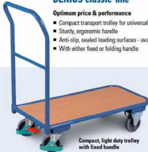
Compact, light duty trolley with fixed handle