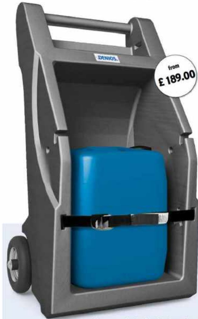
Transport trolley in plastic, incl. tension strap for the practical transport of smaller containers