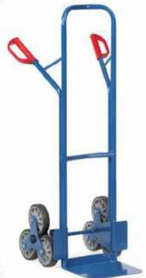
Stair-climbing truck model SK