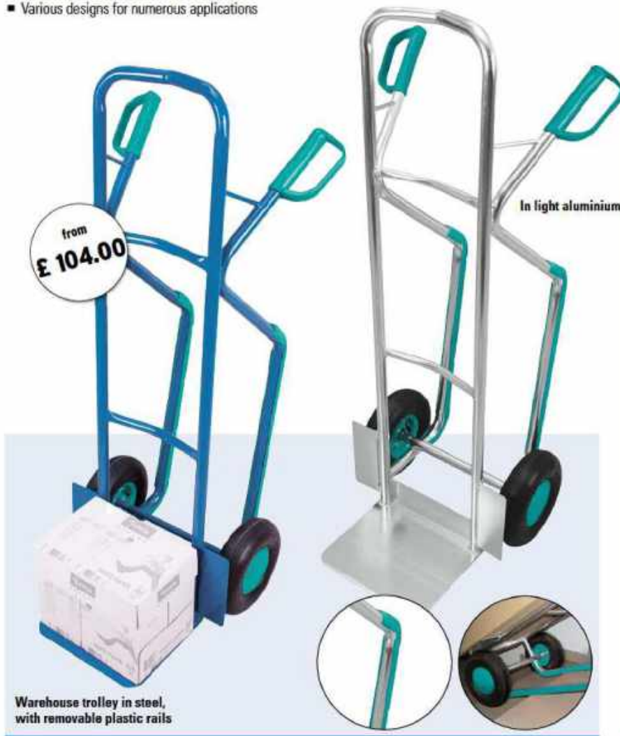
Warehouse trolley in steel, with removable plastic rails

i For more versions of the transport trolley go to www.denios.co.uk