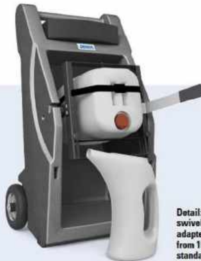
Detail: The sturdy swivel basket can be adapted to fit canisters from 15 to 30 litres as standard.