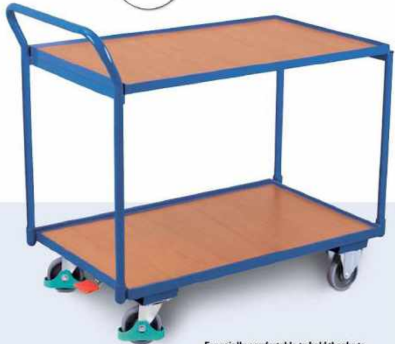
Especially comfortable to hold thanks to high handle