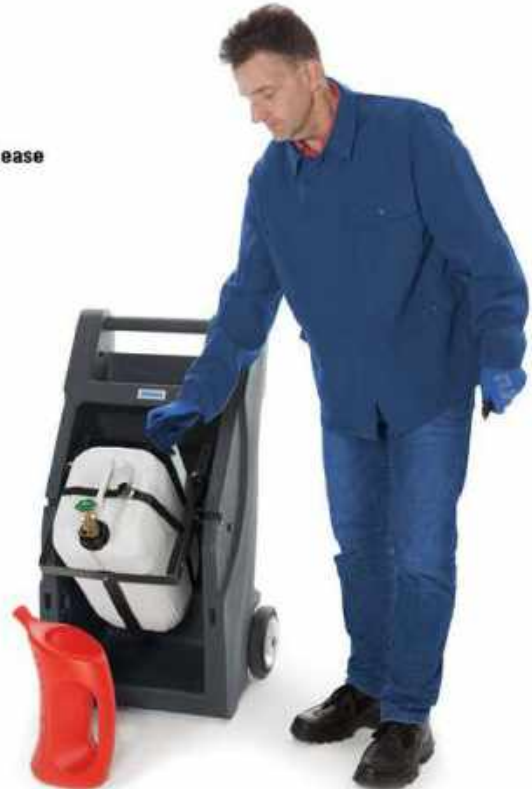
Transport trolley incl. swivel basket for practical dispensing (tray optional)