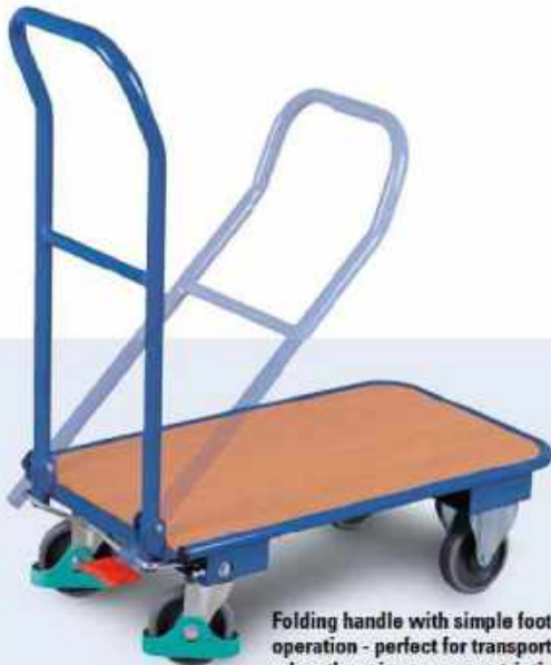
Folding handle with simple foot operation - perfect for transport or when there is a space restriction