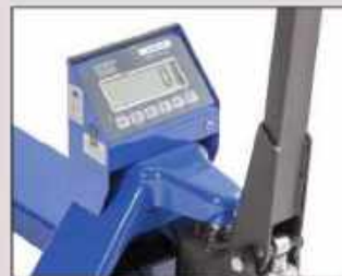
Detail: scales with large LCD display (30 mm) for easy-to-read data

Pallet trucks suitable for EX zones can be found on the internet at www.denios.co.uk