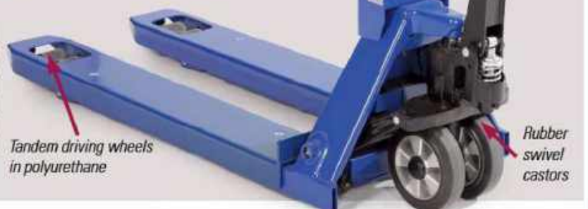
Tandem driving wheels in polyurethane