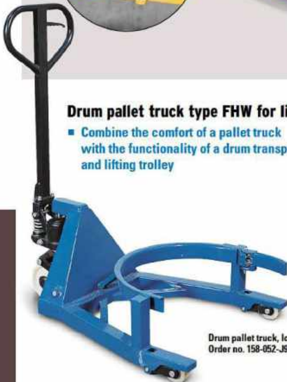
Drum pallet truck, load capacity 350 kg, Order no. 158-052-J9, £ 414.00