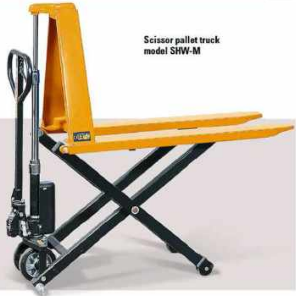
Scissor pallet truck model SHW-M