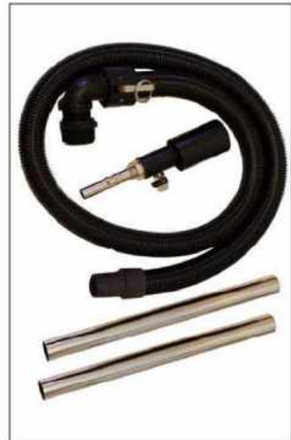
Liquid vacuum cleaner model SV 6.4, For mounting on a steel bung hole drum (available as an option)