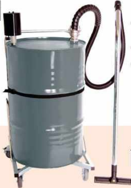
Liquid vacuum cleaner ATEX W200 with 205 litre painted steel container