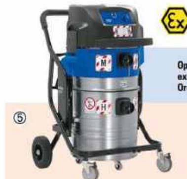
Safety vacuum cleaner model S 960 with 3.5 M suction hose Ø 27 mm, suction hose holder, filter bag and element, tool adapter, cable reel with 7.5 M power cable.