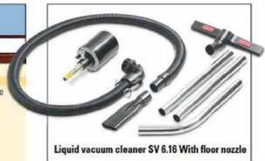
Liquid vacuum cleaner SV 6.16 With floor nozzle