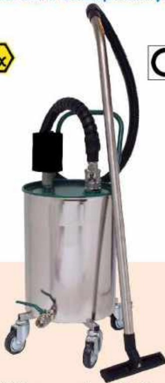
ATEX W54 wet vacuum cleaner with 54 litre stainless steel container