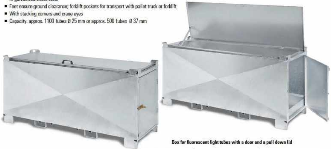
Box for fluorescent light tubes with a door and a pull down lid