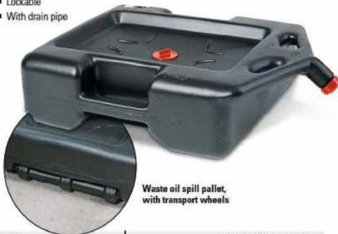
Waste oil spill pallet, with transport wheels