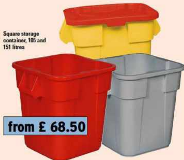
Square storage container, 105 and 151 litres