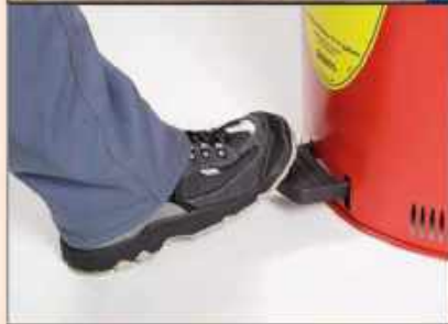
Oily waste container made of red painted steel, 35 litres, with self-closing lid and floor ventilation