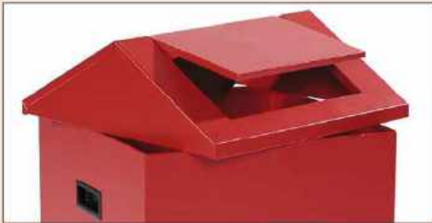
The swing lid cover can be removed for emptying