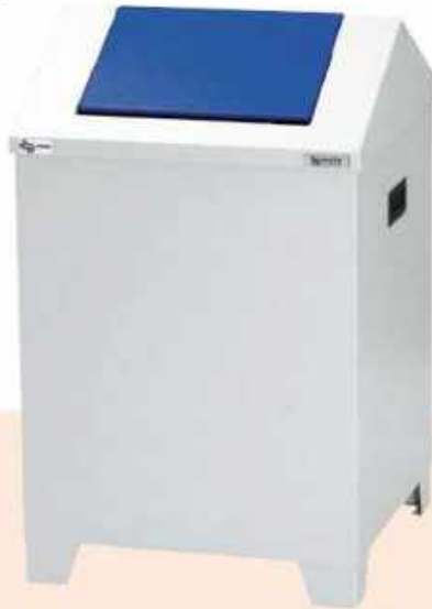
Collection container in sheet steel, in grey (RAL 7035) with swing lid in blue (RAL 5010), Order no. 210-633-J9, £ 162.00