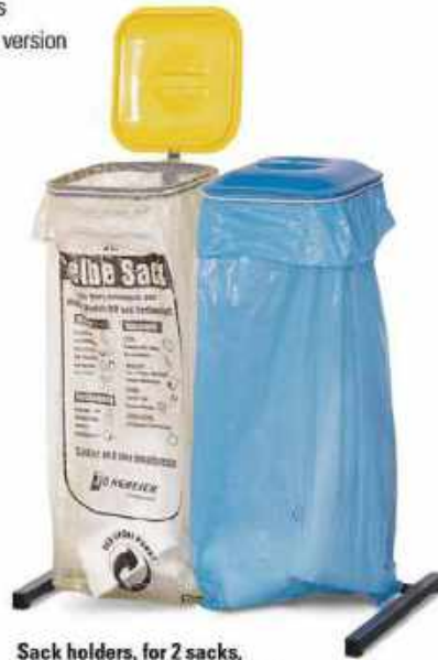
Sack holders, for 2 sacks, Order no. 116-247-J9, £ 106.00