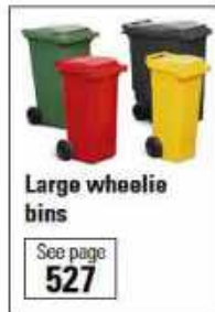
Large wheelie bins