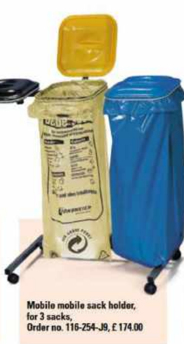
Mobile mobile sack holder, for 3 sacks, Order no. 116-254-J9, £ 174.00