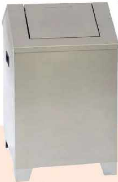
Collection container in stainless steel, Order no. 188-618-J9, £ 272.00