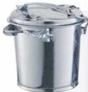
Waste bin system with lid clamp strap and 1 carry handle on the lid, 25 to 50 litres

Go online! Discover even more exciting product highlights! denios.shop/oo.uk-online