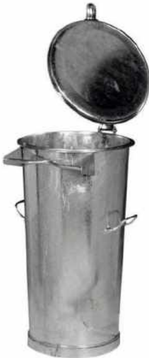
System waste bin with 2 side carry handles, 65 to 110 litres