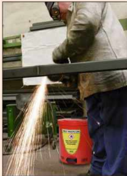
The self-closing lid prevents the content from igniting, e.g. by flying sparks

Damped, self-closing lid mechanism for significant noise reduction and to save material and costs