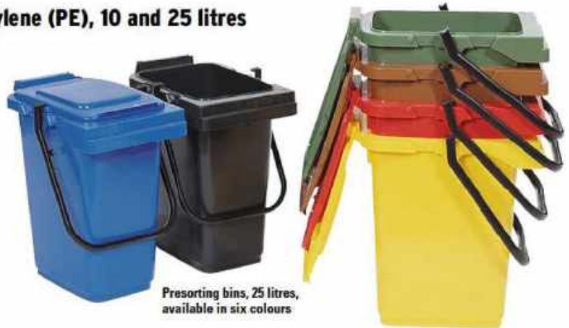
Presorting bins, 25 litres, available in six colours