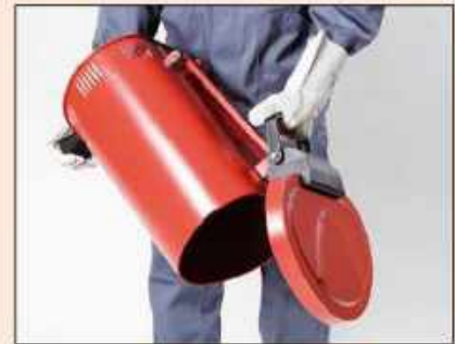
The ergonomic handle makes it easy and safe to empty the container.

Each disposal container is delivered with a multilingual safety label.