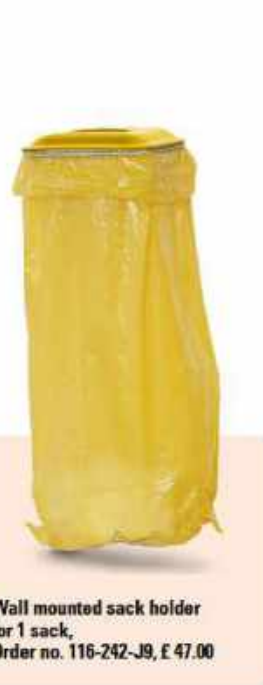
Wall mounted sack holder for 1 sack, Order no. 116-242-J9, £ 47.00