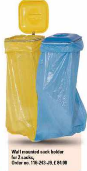
Wall mounted sack holder for 2 sacks, Order no. 116-243-J9, £ 84.00