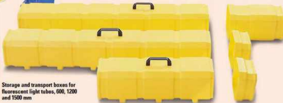
Storage and transport boxes for fluorescent light tubes, 600, 1200 and 1500 mm