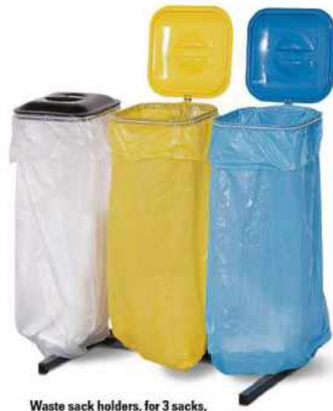
Waste sack holders, for 3 sacks, Order no. 116-249-J9, £ 138.00