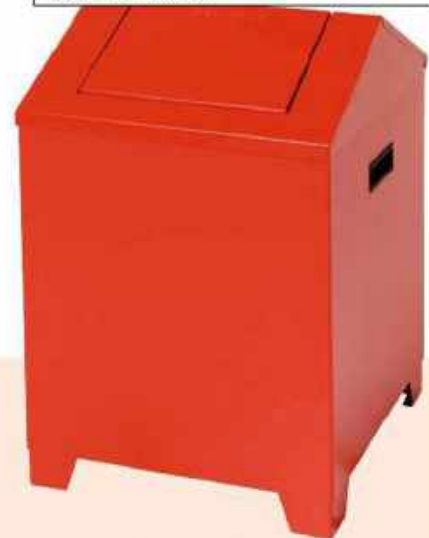
Collection container in sheet steel, in red (RAL 3000)