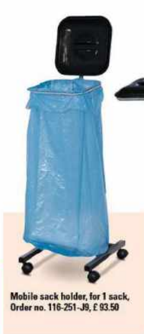
Mobile sack holder, for 1 sack, Order no. 116-251-J9, £ 93.50