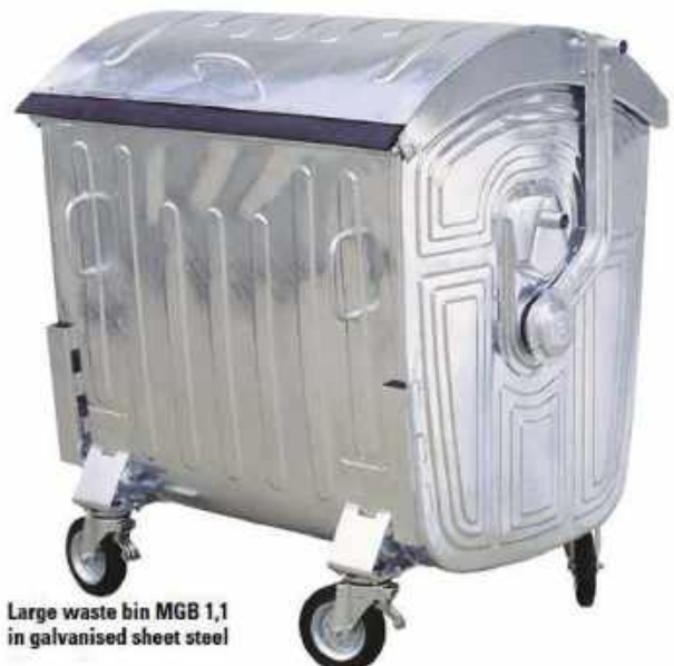
Large waste bin MGB 1,1 in galvanised sheet steel