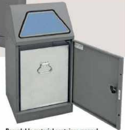
Recyclable material container, manual operation with galvanised inner bin