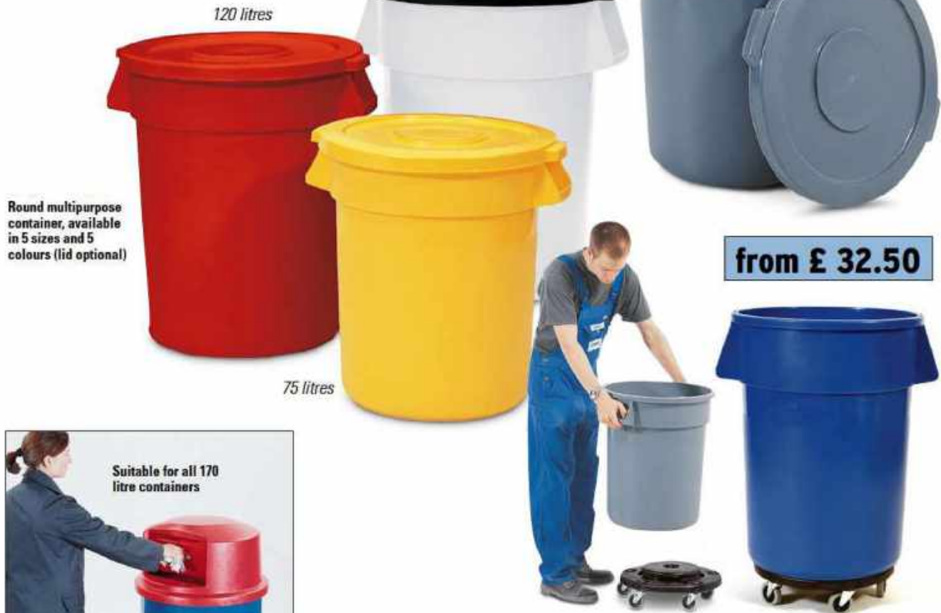
Round multipurpose container, available in 5 sizes and 5 colours (lid optional)