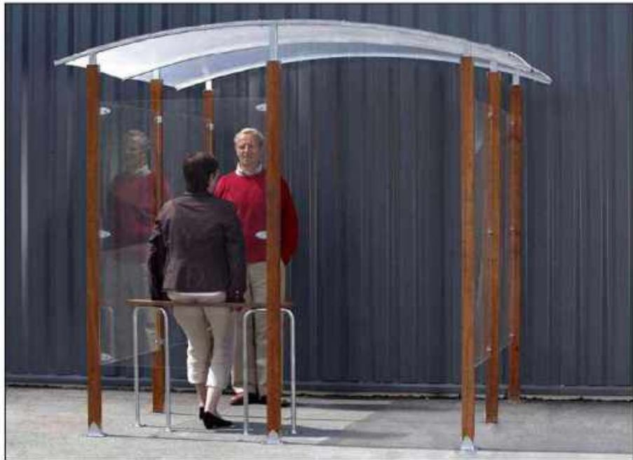
Smoking shelter with wooden design, for 6 people, for wall mounting, including bench seat, Order no. 210-531-J9, £ 2,513.00