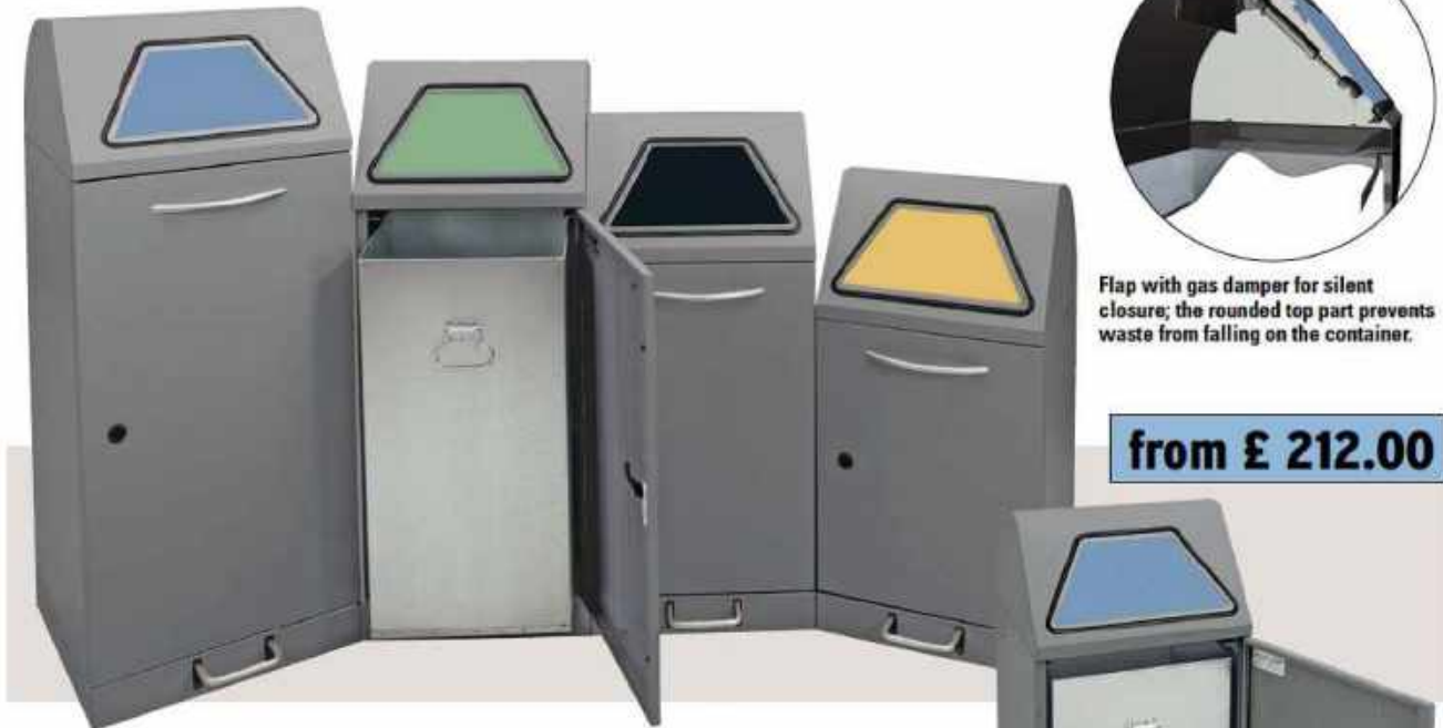
Flap with gas damper for silent closure; the rounded top part prevents waste from falling on the container.