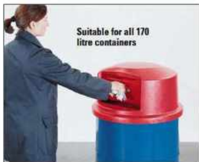
Suitable for all 170 litre containers