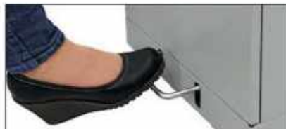
Sturdy foot pedal in stainless steel