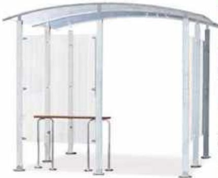
Smoking shelter with steel design, for 6 people, for wall mounting, including bench seat, Order no. 181-986-J9, £ 2,073.00