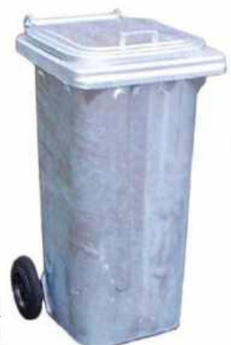
Wheelie bin model 240-Z, Order no. 116-217-J9, £ 289.00

Expert Hotline and Order line: 01952 700 572