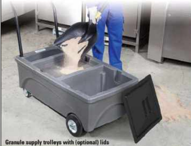
Granule supply trolleys with (optional) lids