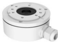
DS-1280ZJ-XS Junction Box