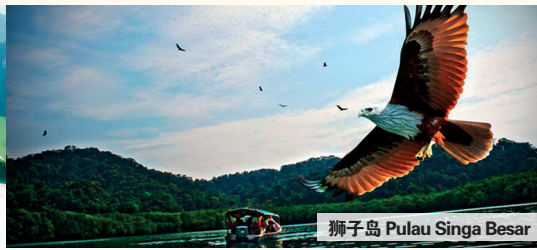
狮子岛 Pulau Singa Besar