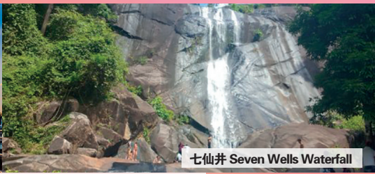
七仙井 Seven Wells Waterfall