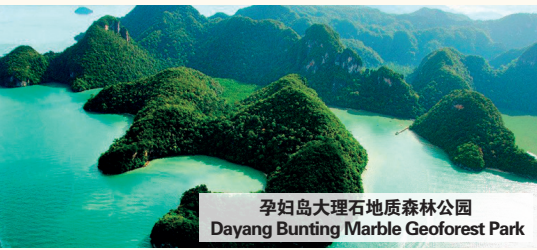
孕妇岛大理石地质森林公园 Dayang Bunting Marble Geoforest Park