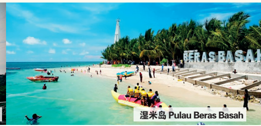
湿米岛 Pulau Beras Basah