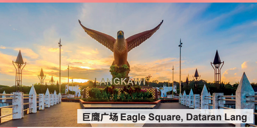
巨鹰广场 Eagle Square, Dataran Lang