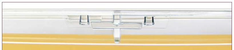
Close-up of the new two way closure system