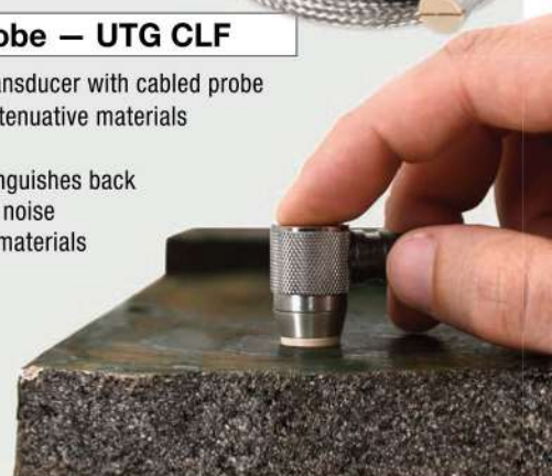
UTG CLF for cast materials