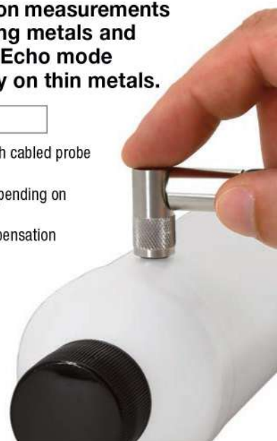
UTG P for high resolution and thin materials