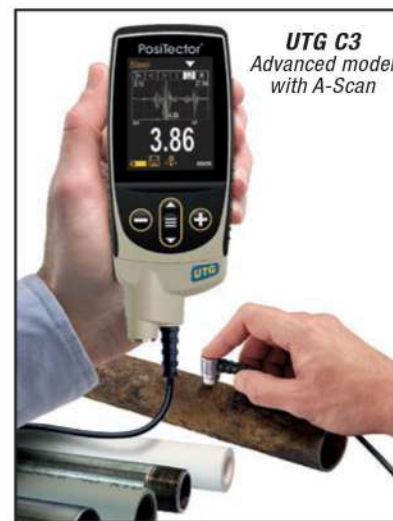
UTG C3 Advanced model with A-Scan

© DeFelsko Corporation USA 2021. All Rights Reserved. Technical Data subject to change without notice. • Printed in USA • PUTG.v.LW/W2101