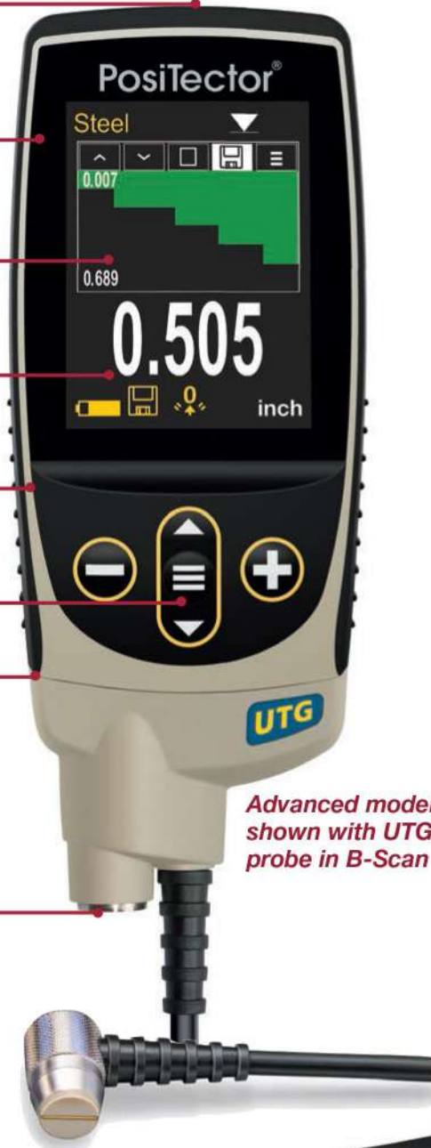
Advanced model shown with UTG C probe in B-Scan

All Gages Come Complete with ultrasonic gel, protective rubber holster, wrist strap, 3 AAA alkaline batteries, instructions, protective lens shield, nylon carrying case with shoulder strap, Long Form Certificate of Calibration traceable to NIST, USB cable, PosiSoft Software, two (2) year warranty on body and probe.