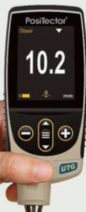
UTG CA for one-handed operation

Measures the wall thickness of materials such as steel, plastic, and more. Ideal for measuring the effects of corrosion or erosion on tanks, pipes, or any structure where access is limited to one side.