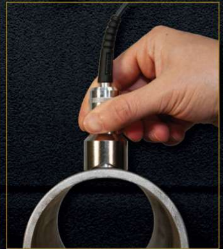
PosiTector SPG OS surface profile probe for outside diameters