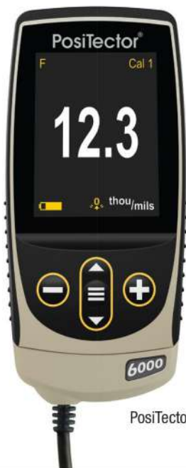
PosiTector 6000 FJS3