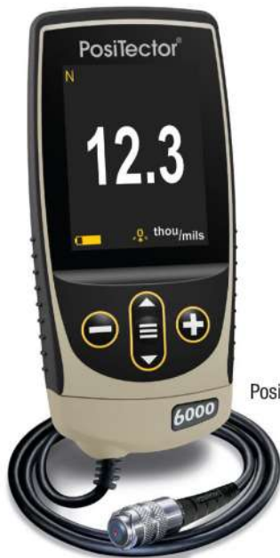
PosiTector 6000 NAS3